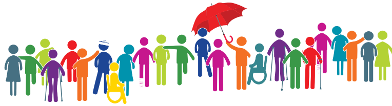
People with disability who go to sex workers in Australia